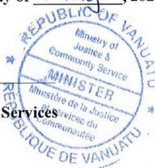
Honourable ESMON ESAI SIMON Minister of Justice and Community Services

Made at Port Vila this 11 th day of May , 2022.