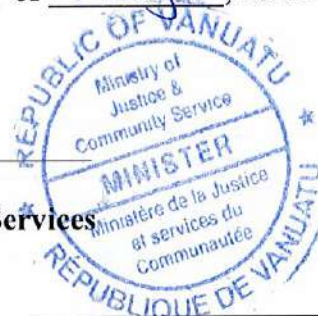
Honourable ESMON ESAI SIMON Minister of Justice and Community Services

Made at Port Vila this 11 th day of May , 2022.